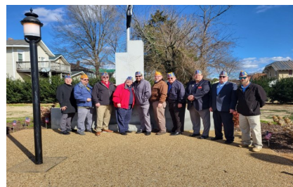
2023 Mid-Winter DEC Meeting