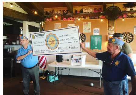
SAL 327/PBR OCV Fundraiser November 2017. Over $5,000 was raised for OCV.