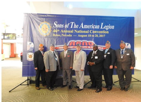
Detachment of Virginia Delegation attending the 2017 National Convention in Reno, Nevada.