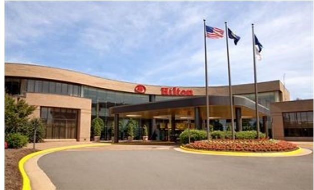
Dulles Washington Hilton is the hosting hotel for the American Legion 100th Annual Convention. Sons will hold their Convention on Saturday.

We would like to have as many SAL Members in attendance at this convention. This is the 100th Annual Convention of the American