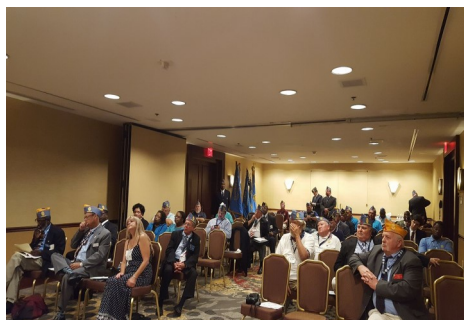
Sons 2017 Detachment Convention.