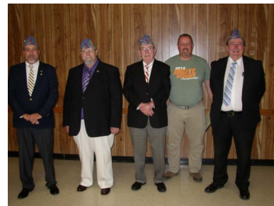
SAL 325 Installation of 2018—19 Officers—June 2018.