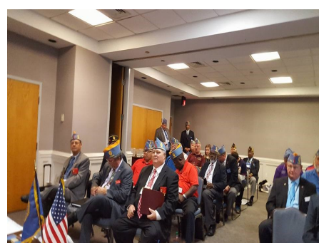
In the two photos above—Fall Conference in Virginia Beach—October 2017.