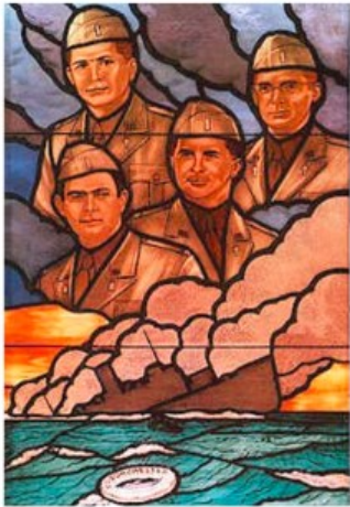
Pentagon Chapel – Washington, DC