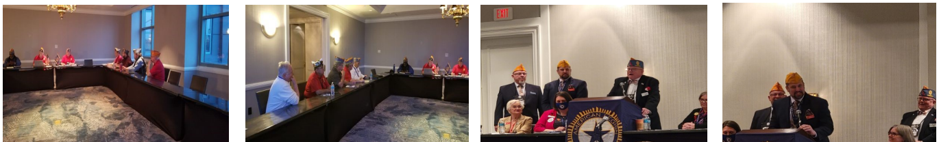
Photos taken at the Spring 2022 Conference in Portsmouth, Virginia. SAL National Commander was the Detachment of Virginia’s guest of honor. Photos above are from the Friday night DEC Meeting, Department of Virginia Auxiliary Spring Session and the Spring Conference Banquet.