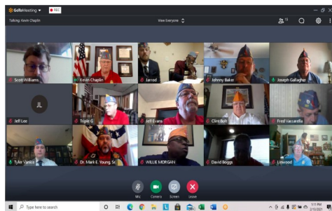
Detachment Mid Winter Meeting 2021