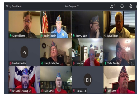
Spring Conference2021 DEC Meeting