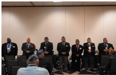
Installation of Detachment Officers at the 2019 Detachment Convention.