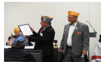
Various Detachment Convention Photos—Detachment Scholarship Award Winner, Squadron Award Winners and Donations, Candidate, Officer Elections, presentation of Son of the Year Award